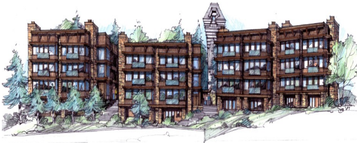
DURANT CONDOMINIUMS - WEST ELEVATION

CHARLES CUNIFFE ARCHITECTS 816 EAST HYMAN ASPEN CO. 81762-0280 www.cuniffe.com