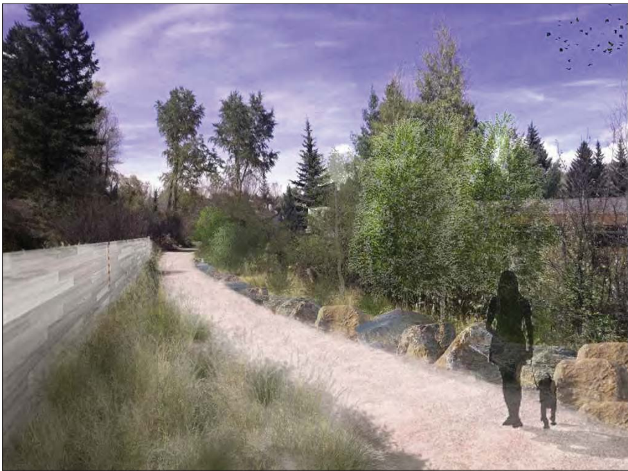
Pedestrian & Bike Trail 4 blocks to downtown from driveway gate