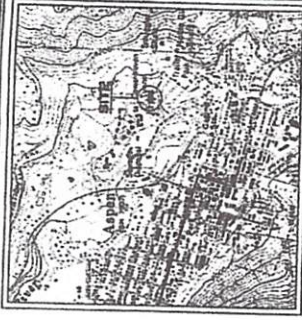
VICINITY MAP SCALE 1" = 1000'