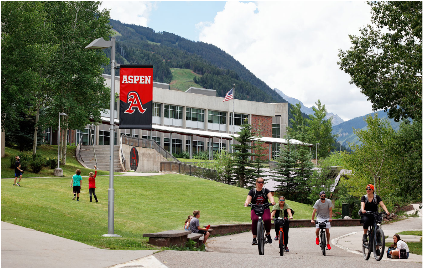
Children play outside Aspen High School in Aspen, Colo., Thursday, July 23, 2020. School district administrators are making plans for reopening the school.