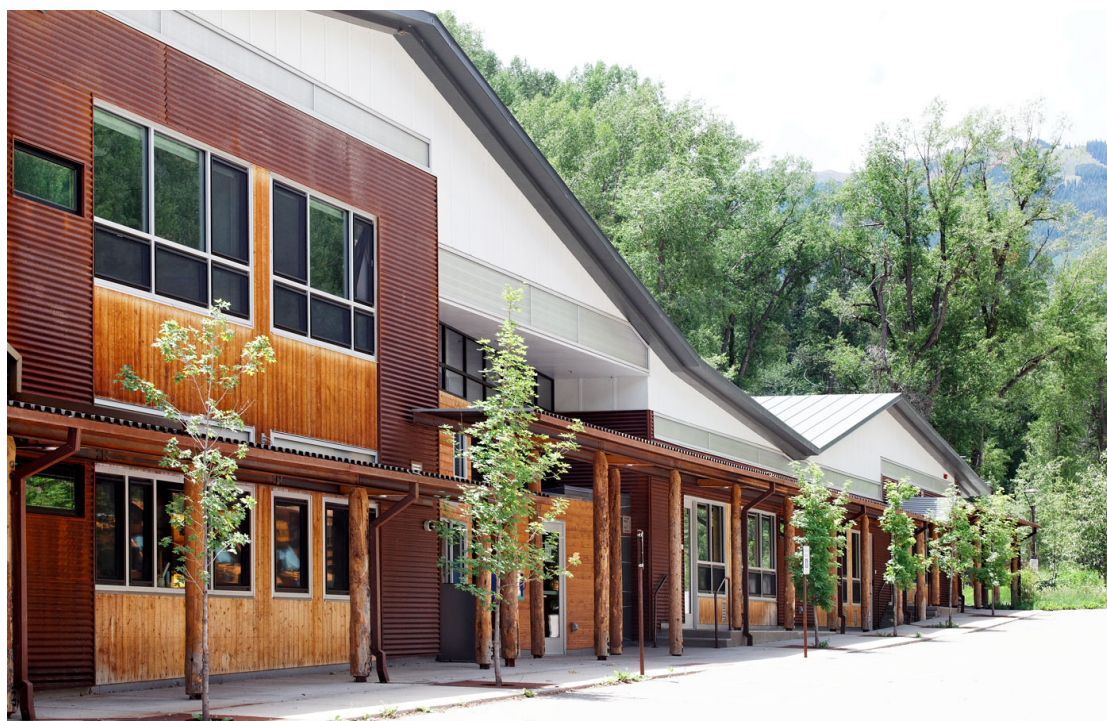
The Aspen Country Day School in Aspen, Colo., Thursday, July 23, 2020. The private school has seen enrollment inquiries double as more second-home owners settle in the Roaring Fork Valley.

Heading into this summer, resort communities embraced part-time residents as the economic foil to declining tourism. “ The summer of the second-home owner ” they called it, sculpting specific campaigns to entice non-resident property owners to come for prolonged stays and help float economies wilting without a steady flow of tourists. Now it’s become the year of the second-home owner.