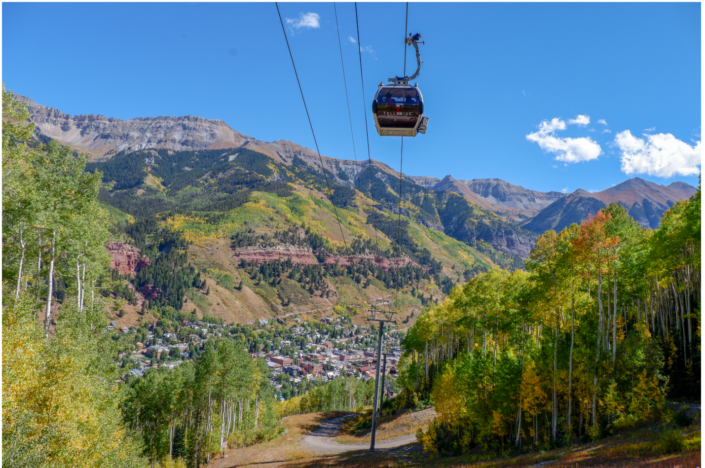
A trail in Telluride, Colorado.