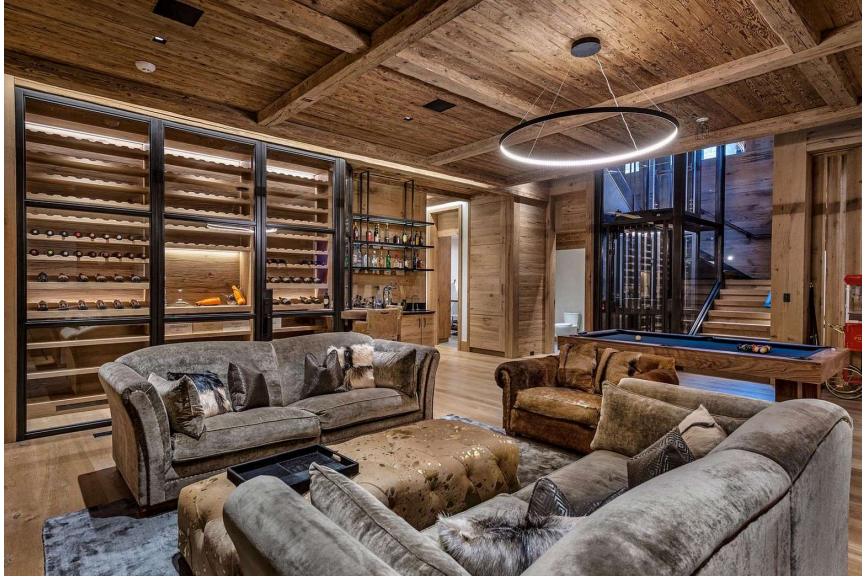
The lower level has a game room and wine storage.

More: Large London Apartments Are Disappearing, Meaning It's a Great Time to Own One