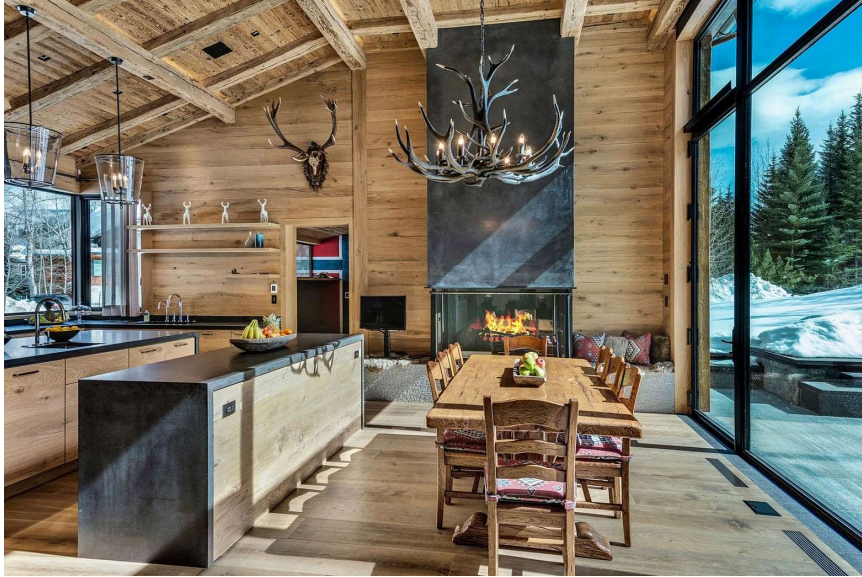
The design of the property was inspired by Swiss ski chalets.

He declined to name the buyers, but said they are a family from the East Coast who had previously rented the home.