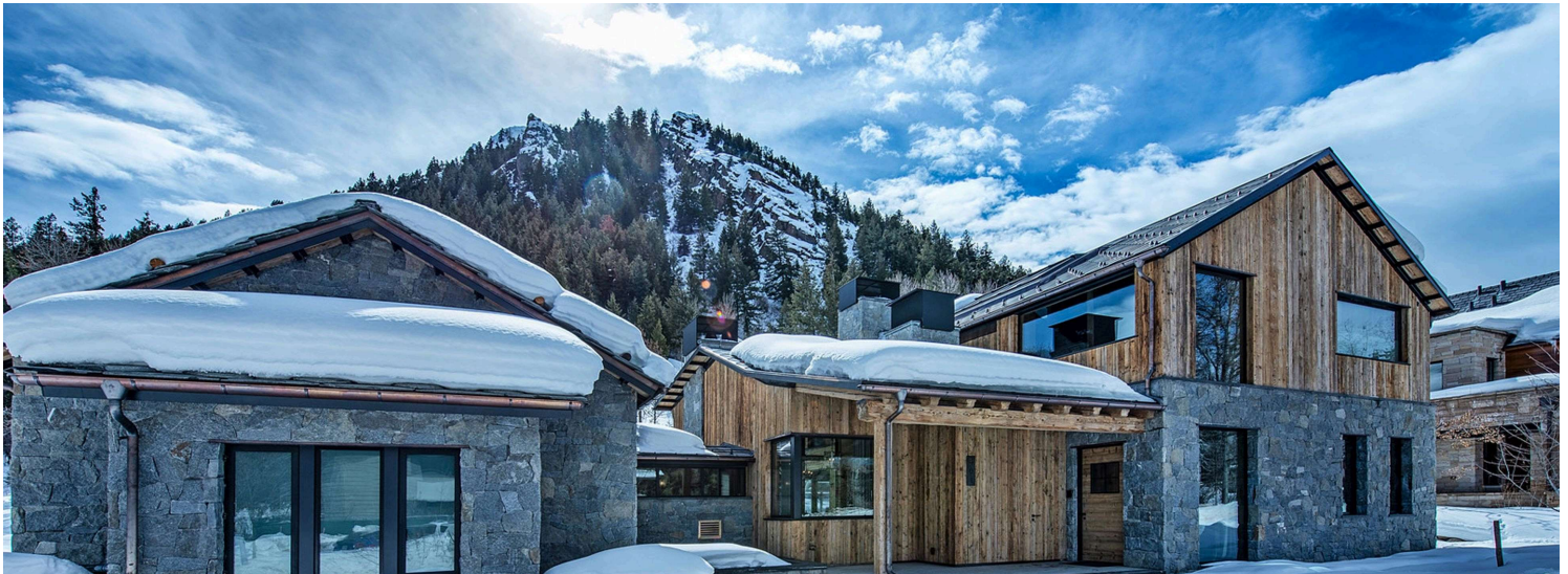
An Aspen, Colo., mansion has sold for $36.975 million.