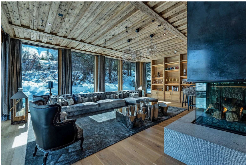
The home was completed in 2018.

More: Steph Curry's Former Oakland Penthouse Selling for Nearly $1.7 Million