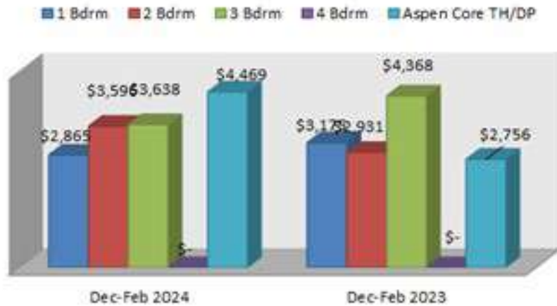
Avg Sold $ / Sq Ft