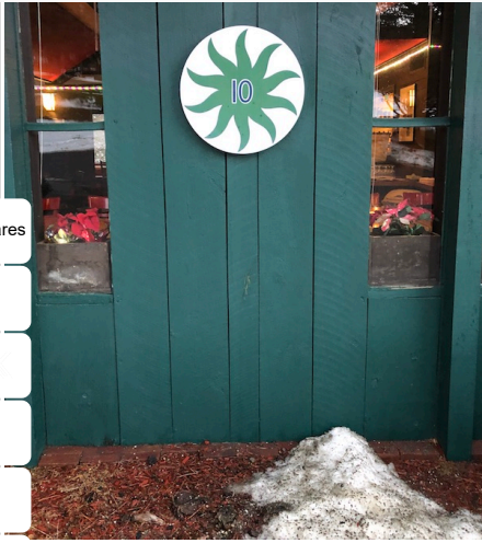
A sun marks the entrance to Ski Club Ten.

ten original lockers have been expanded to accommodate the now 85 member families. Several rooms lay beyond the entryway, a main dining room with an open bar and two smaller rooms to the side, one of which is still designated for children. Becoming a member of Ski Club Ten today seems to still be fairly low-key.