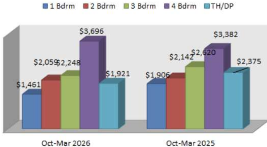
Avg Sold $ / Sq Ft