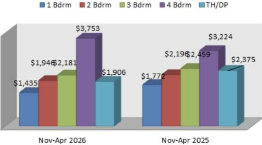
Avg Sold $ / Sq Ft